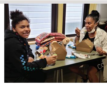
Our family meal program provided 59,323 lunches and dinners , daily continental breakfast and countless snacks.

We could not have done this without our generous event sponsors and attendees.