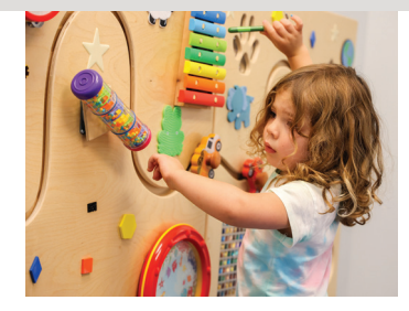
Our outpatient STAR Center served 288 children in just three months.