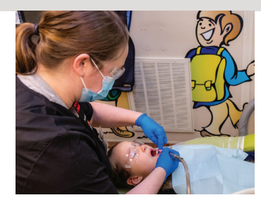
Our Care Mobile provided dental visits and health education information to 1,040 families, right in their communities.